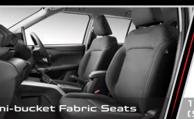
Semi-bucket Fabric Seats