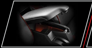
Console Box with Padded Armrest*