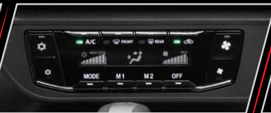
Digital Air Conditioner Controller with Quick OFF Button