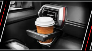
Built-in Cup Holder