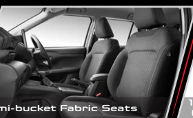
Semi-bucket Fabric Seats