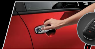
Electrostatic Switch Door Handle

Greater visibility of the front, side and rear.