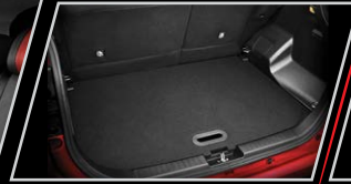
Tier 1: 303 litres