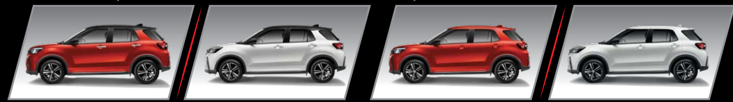
Pearl Delima Red*