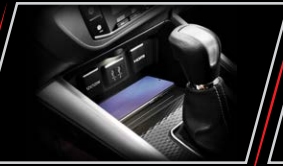
Open Tray with Illumination