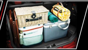
Tier 2: 369 litres