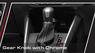
Gear Knob with Chrome