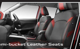
Semi-bucket Leather Seats