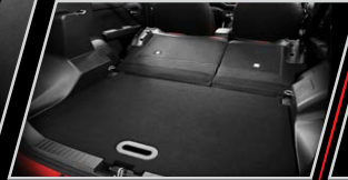
Full-flat Mode Rear Seats