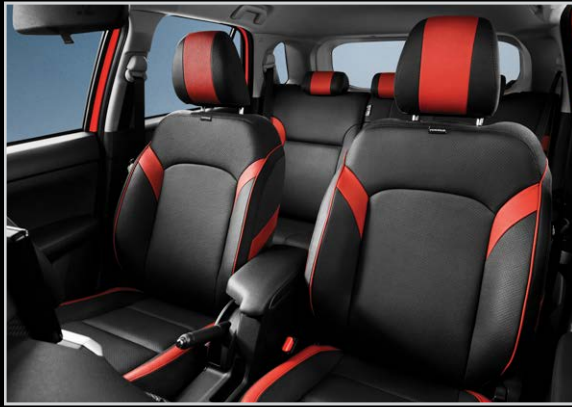
Spacious Interior for a Comfortable Ride