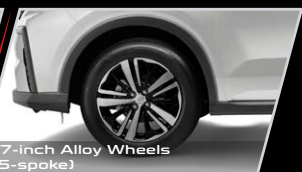
17-inch Alloy Wheels (5-spoke)