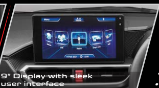
9" Display with sleek user interface