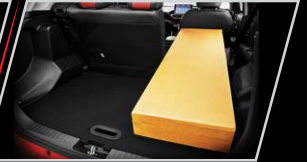
60:40 Split-folding Rear Seats