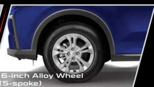
16-inch Alloy Wheel (5-spoke)