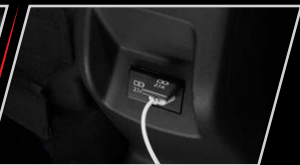
Rear USB Ports*