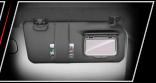
Vanity Mirror with Card Slot