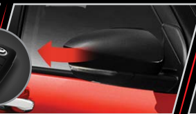
Auto Fold Side Mirror*