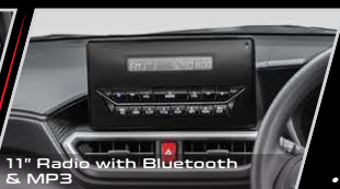
11" Radio with Bluetooth & MP3